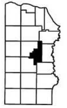
CLINTON CO., IA