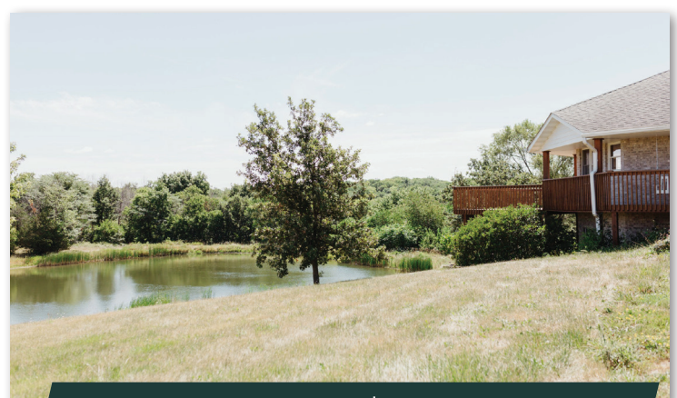
14470 Summerset Road | Indianola, IA 50125

30' x 60' Steel Utility Shed Built in 2005 24' x 32' Open-Front Shed 2 Ponds - 1 Stocked High-Efficiency Furnace and AC