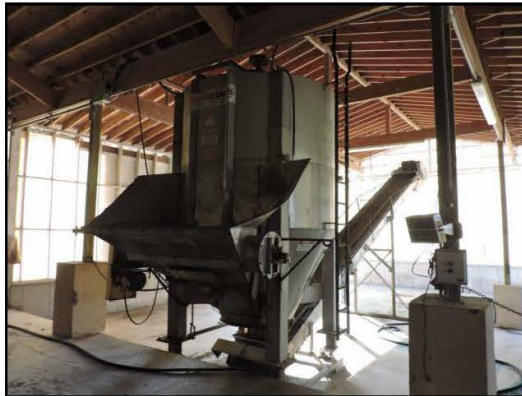
Interior of Fertilizer Building