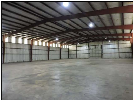
Interior of Warehouse Building