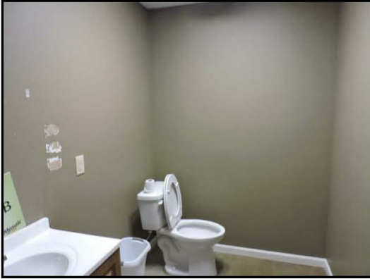
Bathroom in Office