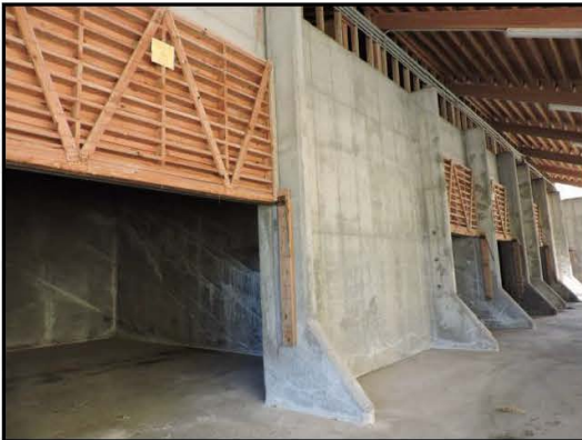
Interior of Fertilizer Building