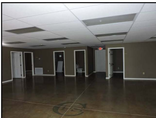
Interior of Office Building